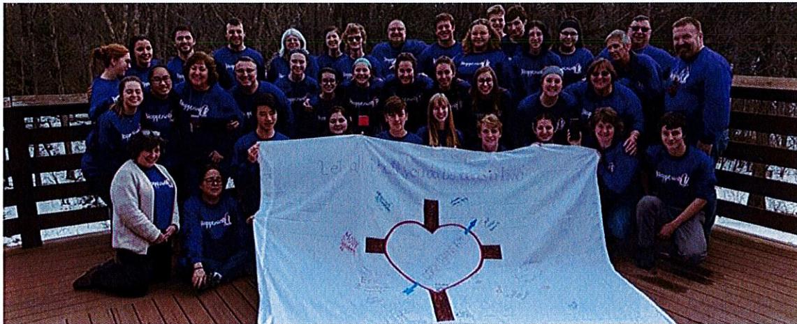
Diocesan Youth Ministry Happening 2019, Pre-COVID-19

Presently in the planning is to develop an opportunity to do bi monthly zoom gatherings with youth and young adults until we can be together for retreats.