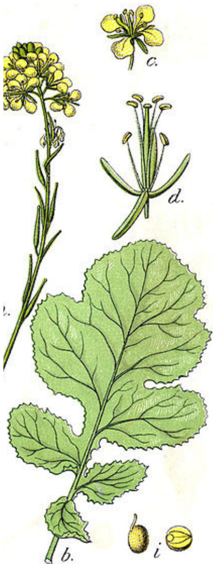
black mustard plant