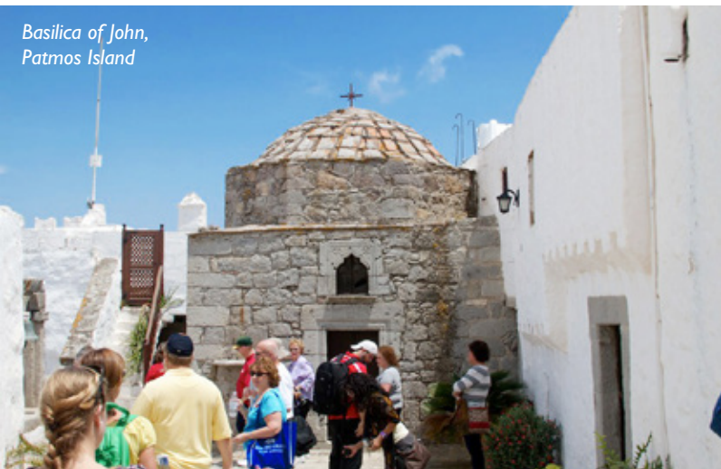
Basilica of John, Patmos Island