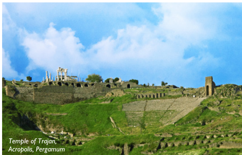
Temple of Trajan, Acropolis, Pergamum

Jun 07 Tue Sardis (Rev. 1:11; 3:1) – Philadelphia (Rev. 1:11; 3:7) – Pamukkale