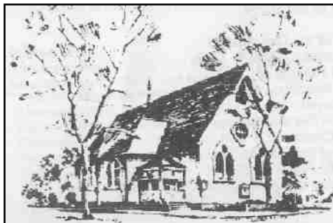
The Episcopal Church of the Advent at the corner of Franklin and Washington Streets

We will attend The Church of the Advent on the corner of Washington and Franklin Streets, Sunday for the 8am service. Breakfast will be immediately following.